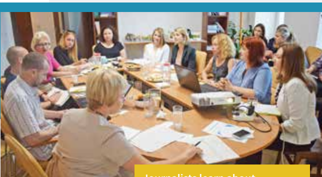
Journalists learn about gender budgeting at first hand