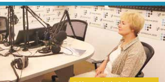
Taking part in the Rankova Khvylya radio program at Hromadske

To disseminate knowledge about importance of the use of gender responsive budgeting, a press brunch was held on 8 June for journalists during which they learned about the significance and importance of the GRB use, outcomes and prospects of GRB implementation in Ukraine at state and local levels, and synergies with other organizations and projects for implementation of gender budgeting.